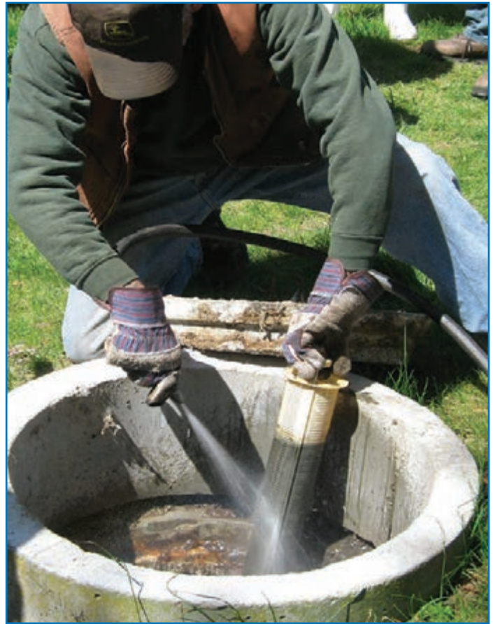
Figure 4. Cleaning an effluent screen over the inlet side of the tank. The riser installed on this tank allows quick access for maintenance activities.