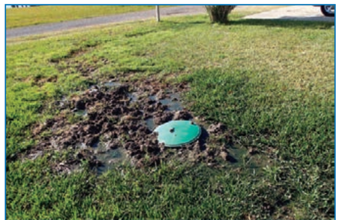
Figure 2. Surfacing effluent around a failing septic tank. Excessive vegetation, foul odors, stained soils, and saturated ground can indicate that the septic system is failing.

If your system is not maintained properly, it will malfunction (Fig. 2). Follow the maintenance instructions for the equipment installed for your system. A poorly designed, constructed, or maintained system can fail and return contaminated water to the surface of your property and to lakes, streams, and well water.