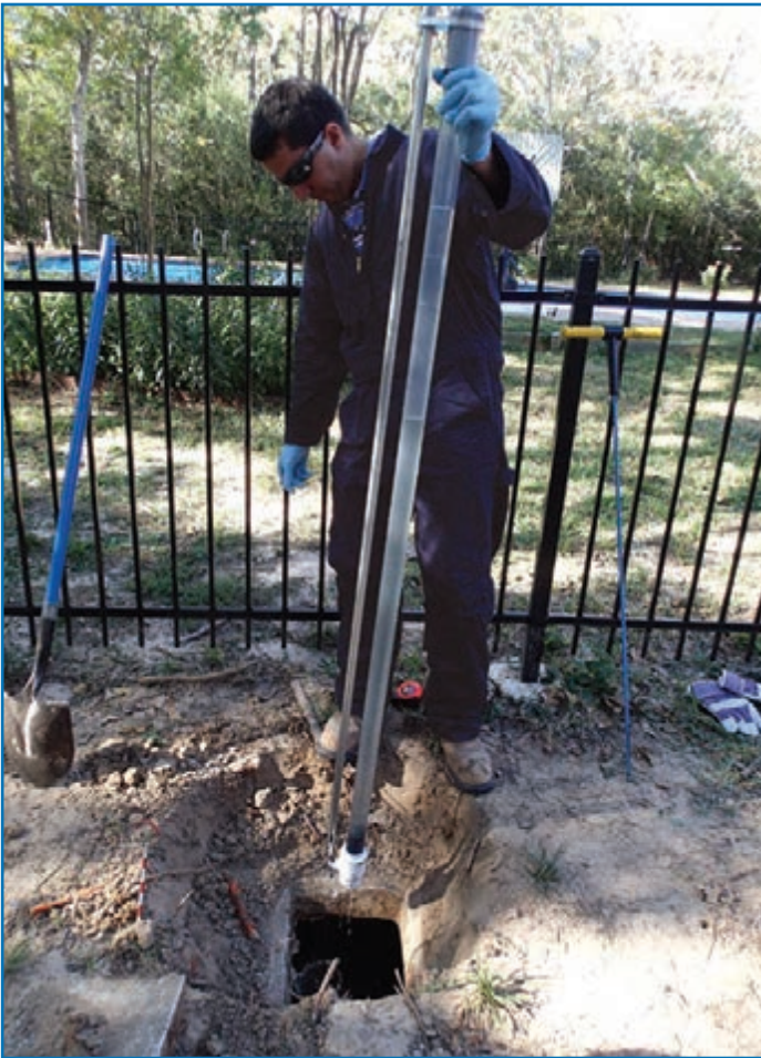
Figure 3. Inspecting scum and sludge layers inside the tank.

Follow these steps to help the microbes in the septic tank treat the wastewater properly: